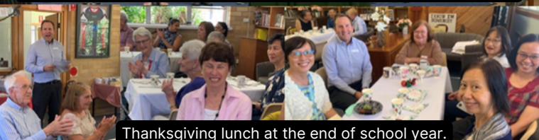
Thanksgiving lunch at the end of school year.

Is your child attending a Public School in 2023? All NSW public schools are required to allow authorised churches and religious groups to teach special religious education for half an hour per week. Our generous volunteer catechists teach at 6 primary schools (Epping Heights, Epping North, Epping Public, Epping West, Roselea and Murray Farm) and 3 secondary schools (Carlingford High, Cheltenham Girls' and James Ruse Agriculture). Catechists from other parishes teach in schools elsewhere.