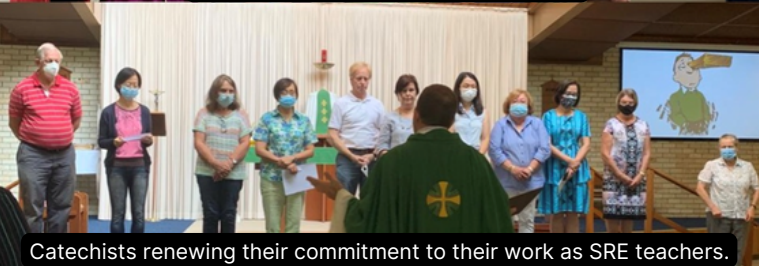
Catechists renewing their commitment to their work as SRE teachers.