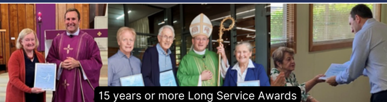
15 years or more Long Service Awards